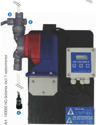
Art. 140050 HQ-Solomix incl. 1 watermeter

The pump is supplied complete with watermeter and tubing