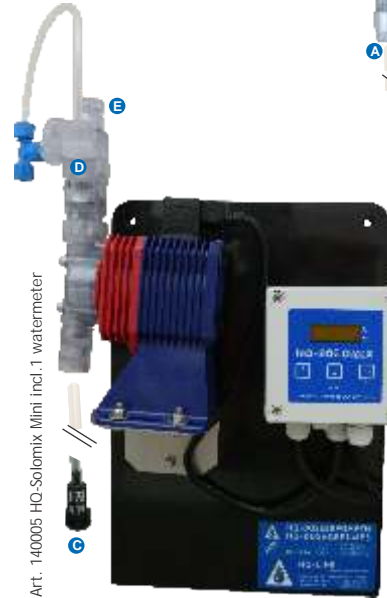
Art. 140005 HQ-Solomix Mini incl. 1 watermeter

HQ-Solomix MINI has a high capacity, you can easily handle your entire company with a device, the pump can also work up to 5 bar. The water meter can be adjusted to your water pipe diameter, on this way you keep enough water pressure on your company.